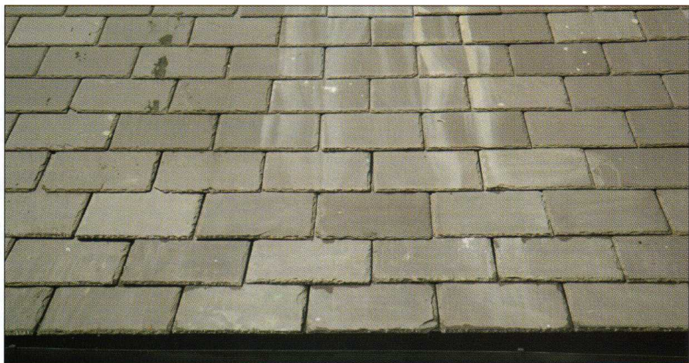
Repairs carried-out with 'Jenny Twin' system.